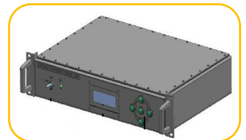
Servo Control Unit (SCU)